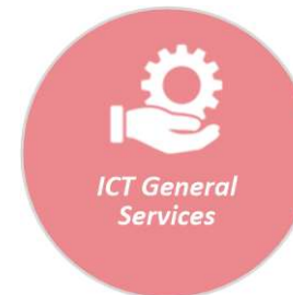
ICT General Services