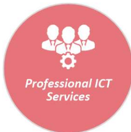
Professional ICT Services